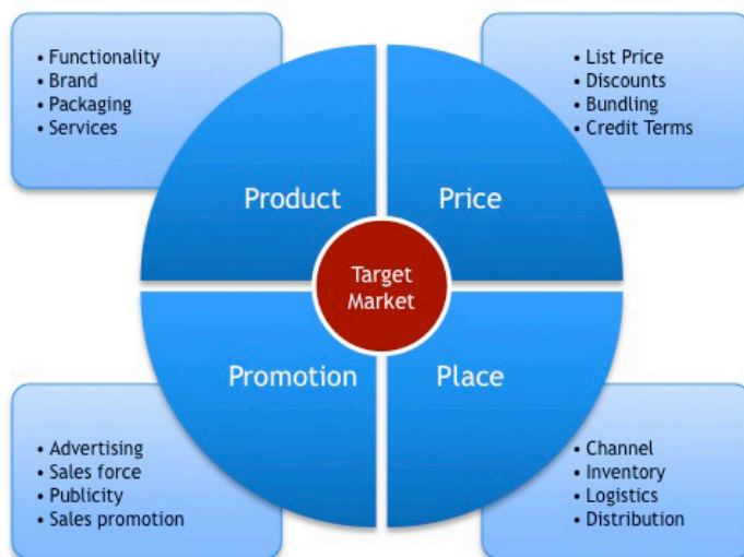
Figure 1. The 4 P’s of successful sales and marketing (Xerox.com)

Australian wine as an example of the 4 P’s: Australian wines – almost unknown in the U.S. during the early 2000’s – have grown to hold a greater than 20% stake of the US wine market 3 . This success, which