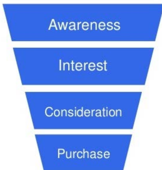
Figure 2. Purchase funnel

Used in a number of professional settings (e.g., The UC Davis Graduate School of Management Entrepreneurship Academy), the model highlights long established elements required for success in business and marketing.